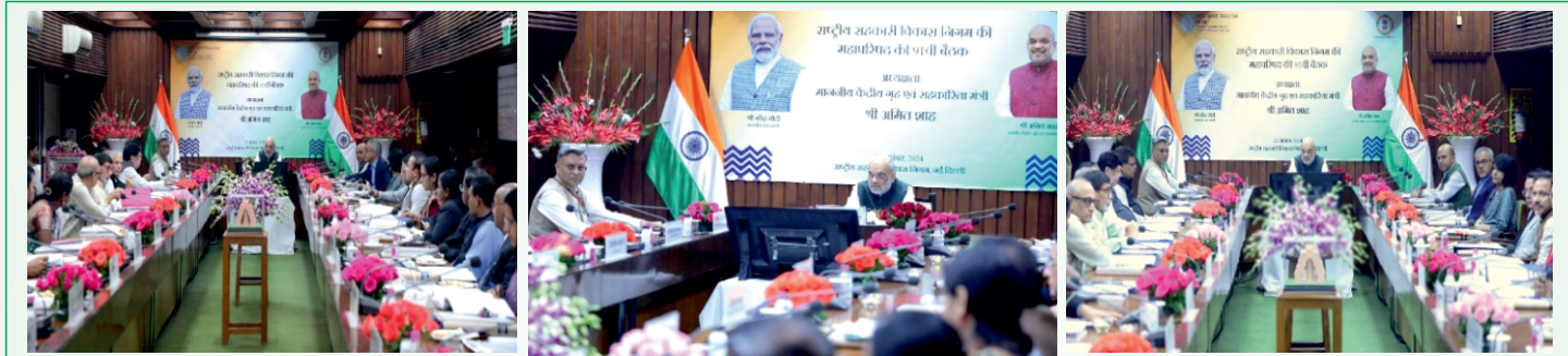
Hon'ble Union Home & Minister of Cooperation, Sh. Amit Shah chaired the 91st General Council Meeting of the National Cooperative Development Corporation (NCDC), focusing on the White Revolution in Northeast States on 22.11.2024 in New Delhi. He highlighted NNDDB's collaboration to establish Milk Producers' Associations, empowering tribal communities & women.

Poopara village, the initiative was spearheaded by the Krishi Vigyan Kendra (KVK), Idukki, under the Tribal Sub Plan scheme. The high yield seeds used for the trials are GPU 67, CFMVI, and ATLI. These were developed by various millet research centres and was cultivated in Idukki for the first time. The trial farming was part of an on-farm testing initiative to evaluate the performance of selected finger millet varieties in the region. Traditional millet varieties typically take 180 days to mature, but these new varieties require only 120 days, significantly reducing the farming cycle.